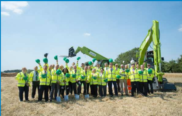
A sunny start on site for the A120

Representatives from, Hertfordshire County Council, Local Enterprise Partnership, Environment Agency, Department for Transport, East Herts Council and GRAHAM gathered at the site to celebrate the official start of the work at a 'Space in the Ground' event on Tuesday 23 July.